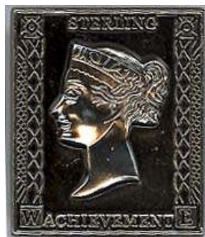
Sterling Achievement Medal

Randy Tuuri - Finland - The 1806 40 Penni Issue at East Bay Collectors Club,