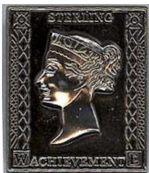
WE Sterling Achievement Medal

The award is not for women exhibitors only – it is given to ANY exhibit (including those by men and youth) that meets the above criteria.