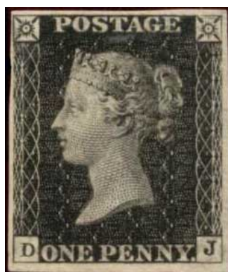
Great Britain #1 Stamp, Queen Victoria

During her time of seclusion, reforms of government in England kept England from the turmoil that was occurring on the Continent.