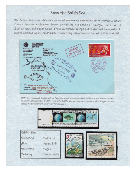
Salish Sea Title Page

It was a fun exhibit to create, to tell a story without having to follow philatelic rules or exhibit to the judges. Many non-philatelists enjoyed the exhibit and were amazed that these topics were on postage stamps. Everyone should create opportunities to exhibit outside of the normal confines of stamp shows. Who knows you may find your next stamp buddy!