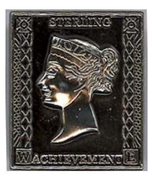
Sterling Achievement Award

David Plunkett - Final Encampment of the Grand Army at StampShow/NTSS