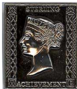
Sterling Achievement Medal