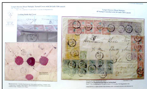
Double exhibit page

If you are mounting the exhibit yourself, the materials can be on one page of your double, the second page can just have the large object's corner mounts on them. The cover or whatever large items can travel on that second page. On the day of the show, the double can be put together at the