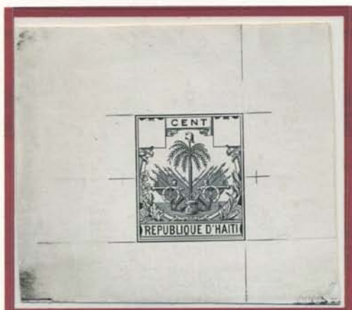
Undenominated recess engraved die proof. Only known example.