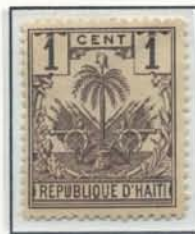
1c brown lilac