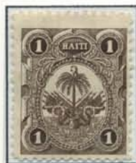
1c essays, imperforate and perforated. Likely made in Germany. Only known examples of the 1c in brown.