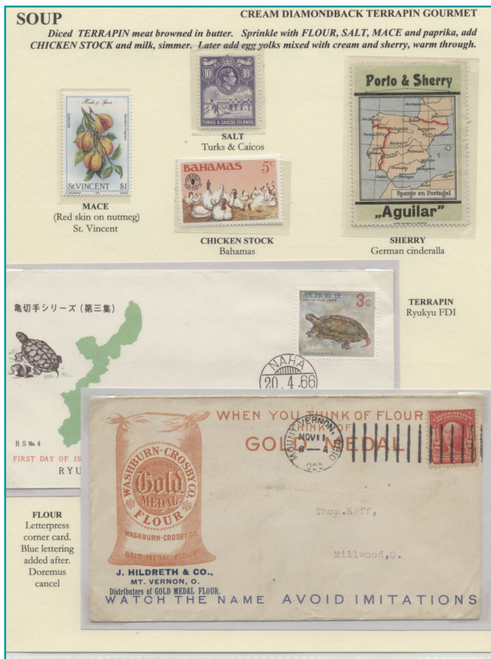
Figure 6. A cinderella item illustrates the ingredient sherry in a recipe for creamed diamondback terrapin. See how carefully the exhibitor chose the elements exhibited on this page to tell the story?

subject. Being right-brained makes this a lot easier than those who are left-brained. Right brainers also have a love