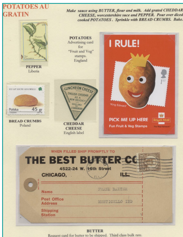
Figure 4. The "Welcome Back Dinner" menu included potatoes au gratin, whose recipe is illustrated by this page in the exhibit.