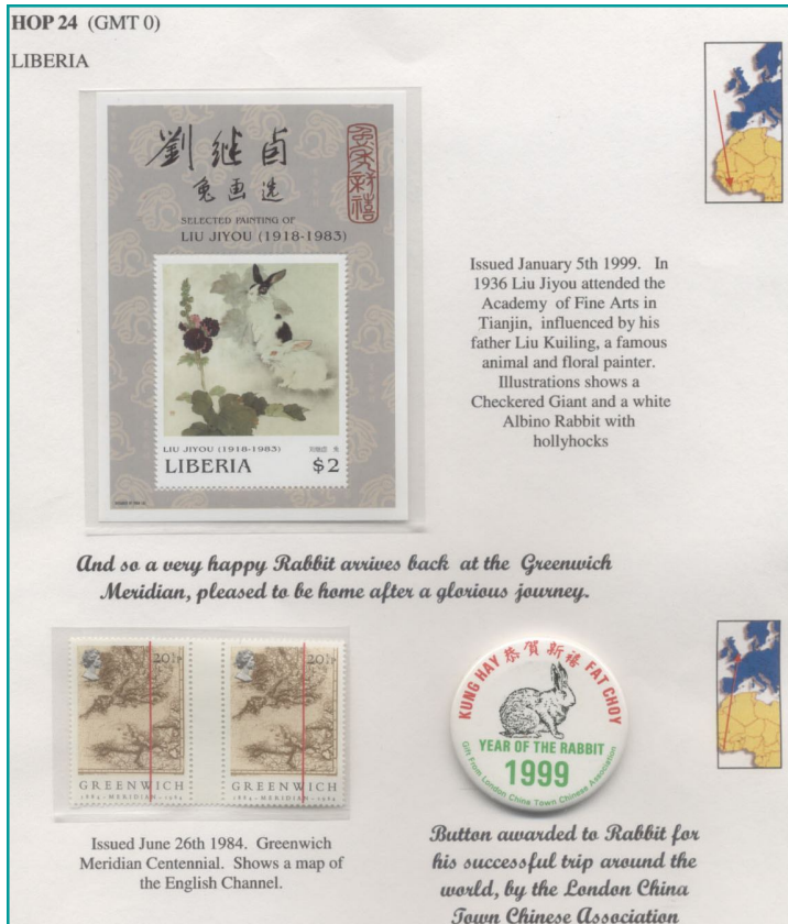
Figure 2. Liz Hisey's "Around the World" exhibit is a Display exhibit, which can incorporate non-philatelic materials to help tell a cohesive story.

in his hutch waiting for some commercial usages to turn up before venturing out again. This is a challenge to find as few dealers carry modern covers.