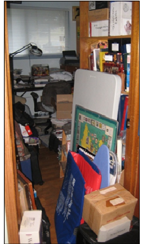
Figure 2: Stamp room from hallway.