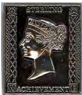
Sterling Achievement Medal