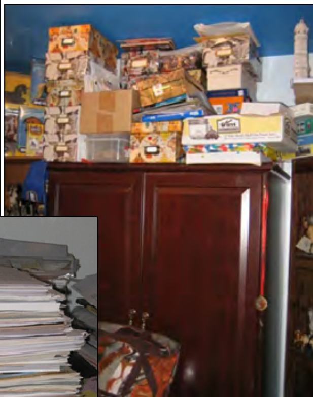
Figure 6: Above, my full armoire with lots of boxes piled on top.