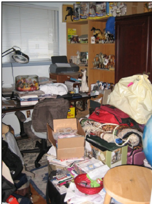
Figure 1: Entrance to still messy stamp room.

Seven boxes of stock to sell go downstairs into YSC stock/storage room. I sort