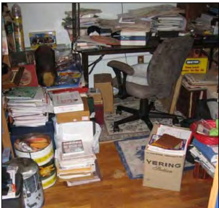
Figure 4: I can see the hardwood floor but want to see more.

Next issue – Does Carol finally get her stamp room cleaned out or is this a never-ending event for her?