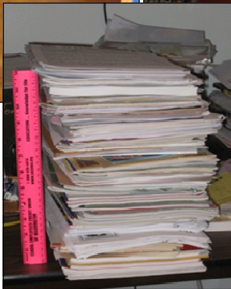
Figure 5: Foot-high stack of papers.

Stack of journals, newsletters, exhibit entries and evaluations to sort through (figure 5); already did a smaller stack. Recycle older journals. Seriously – with all the philatelic journals my husband and I subscribe to, we just don't have the room to store every copy of every journal.